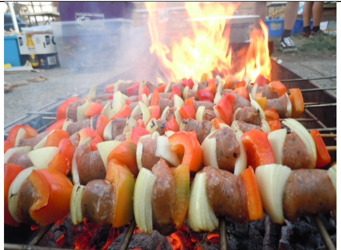
Sharks Kebabs after...