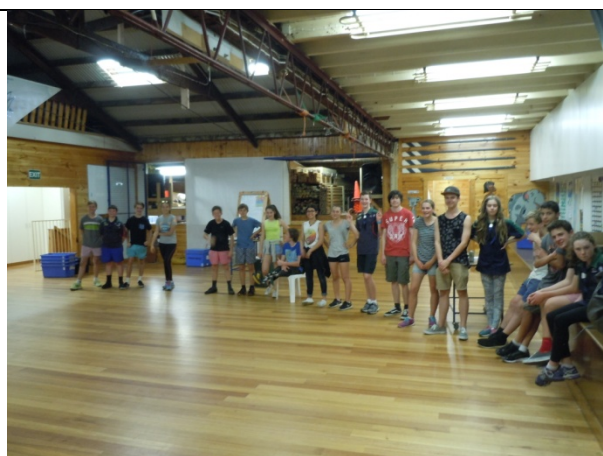
The scout youth leaders