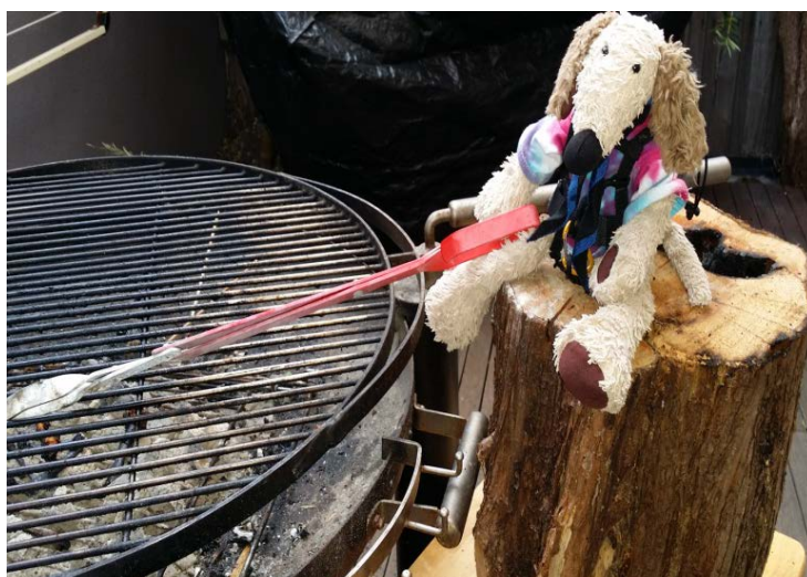
“Scruffie the Adventure Dog (AKA SuperScout, Chief FireDog)”