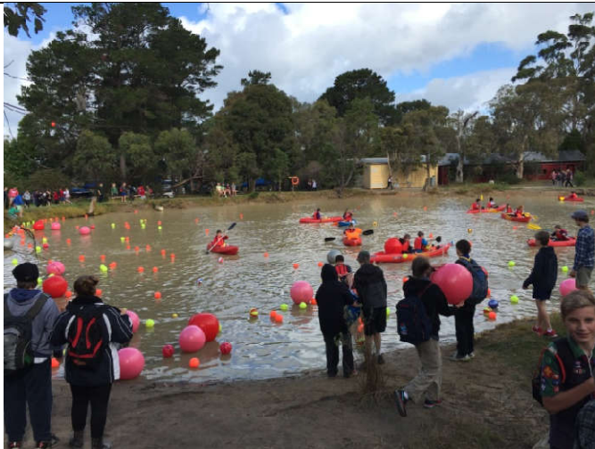
CANOEING with AUDIENCE participation