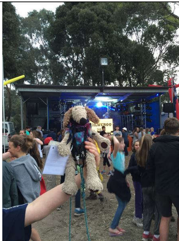
“Scruffie the Adventure Dog (AKA Disc Jockey, AKA Expert Dancer, High Achiever , Role Model)”

“Local Event is a Smashing success as Brighton Scout troop excells at all events, Adventure dog held High as an Example to all” and hosts Disco for 1000 scouts and few badly dancing adults