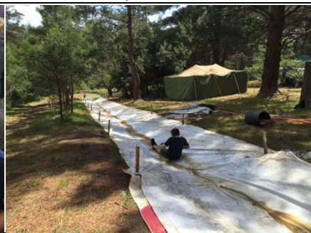
Water slide - Be careful, once you start, its a slippery slope.