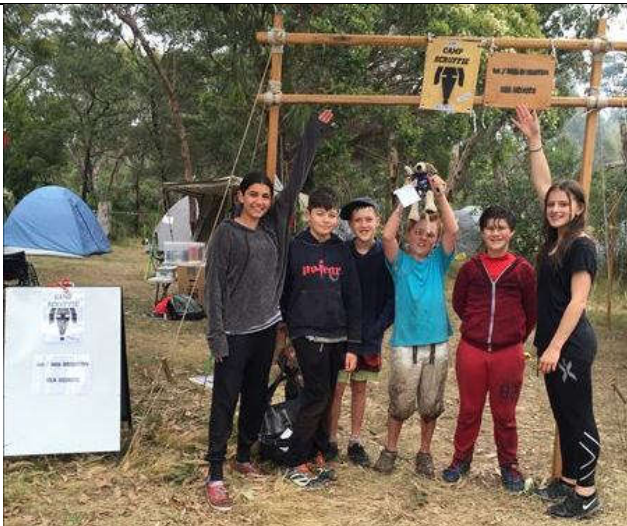
Sharks patrol kindly test the "human flap" on Scruffie's new camp Gate- The patrol felt it should be a "patrol flap" but Spot pointed out that Humans come in individual portions as well.