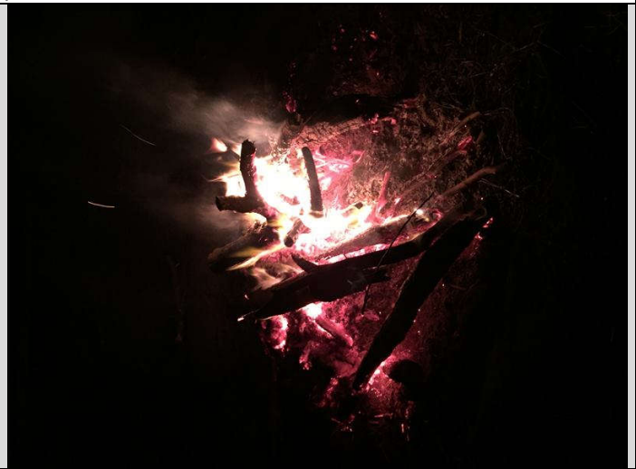
If you look deeply into the flames you may see Scruffie looking back out at you. - Or not