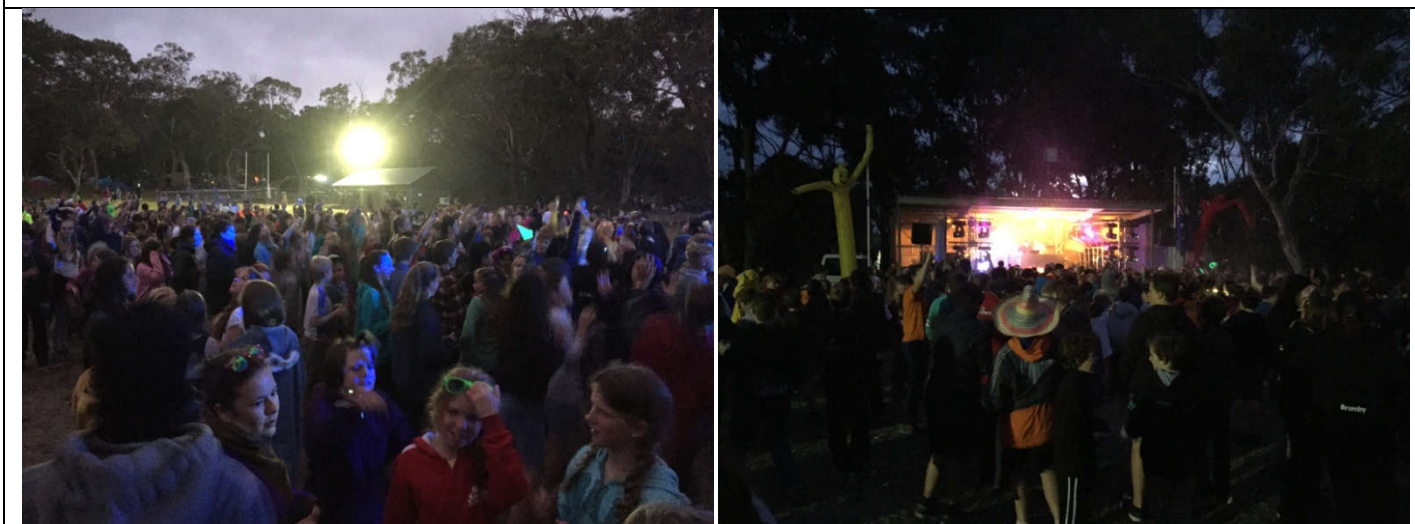
Party time at Gilerwoo