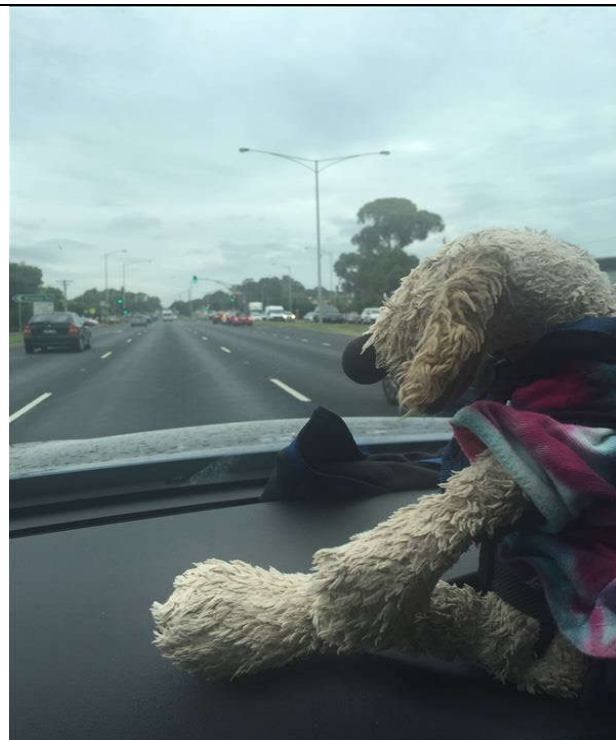
“Scruffie the Adventure Dog (AKA Chief Navigator, Camp Co-ordinator, Youth Leader, Driving Instructor)”

“Local Dog arranges Mini Jamboree event in Mount Martha” and sets up a base camp for 56 Scout members!