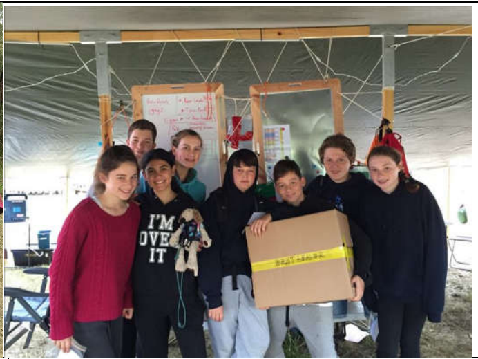
TROOP COUNCIL Meeting - Finally a good TC 6 Meeting photo