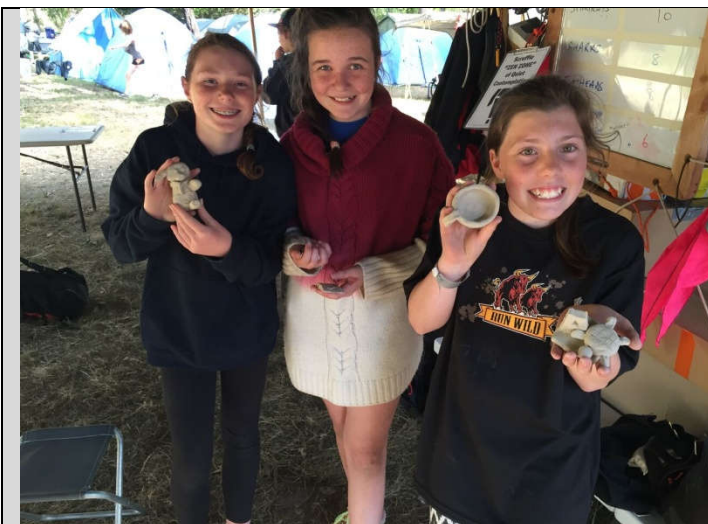
Regional Sculpture troupe are inspired by Scruffies leadership to erect a fantastic Sculpture to him winning creativity award