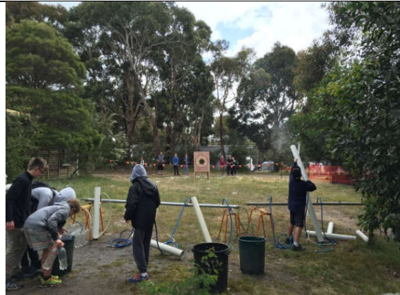
ROCKET LAUNCHERS - Flatheads take aim at the leader centre left