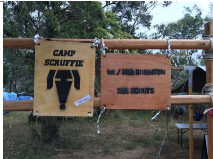
Scruffie Launches his new Branding and Logo to wide acclaim. Universal adoption follows- Expressions of interest have been acknowledged from Gruen Nation.