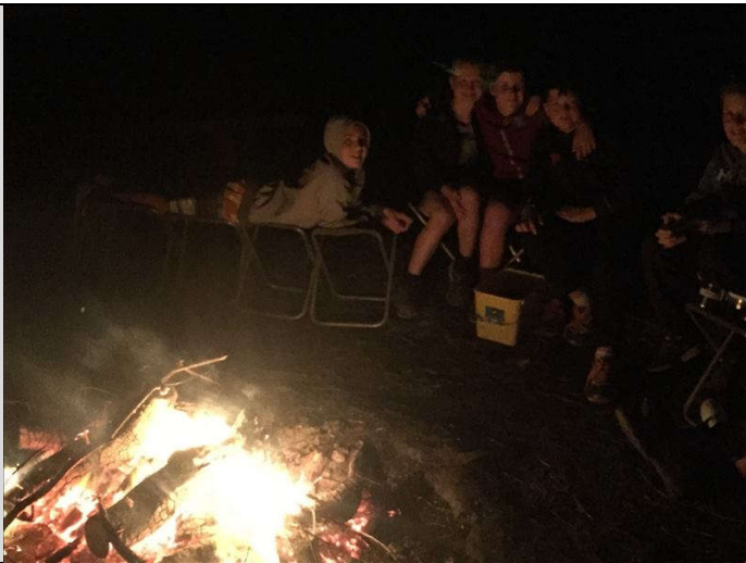
Campfire Friendships old and new