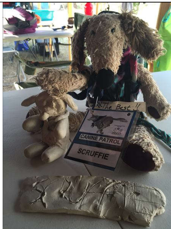
“Scruffie the Adventure Dog (AKA Competition Referee, ART and Sculpture Critic, Canine Patrol- PATROL LEADER )”

“Statue Erected to honour local Adventure dog ” and baths are forced on innocents even though it's not the end of the canine year