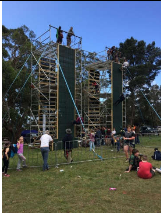
ABSEILING - Not a joking matter