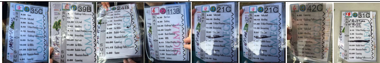
Each Patrol Receives its Schedule list - Eventually - A close run thing