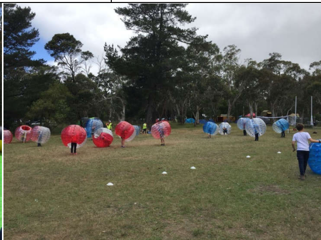
It looks funny but once you get into it, you can bubble with excitement (Bubble Soccer) - Go Bubbleroos.....!