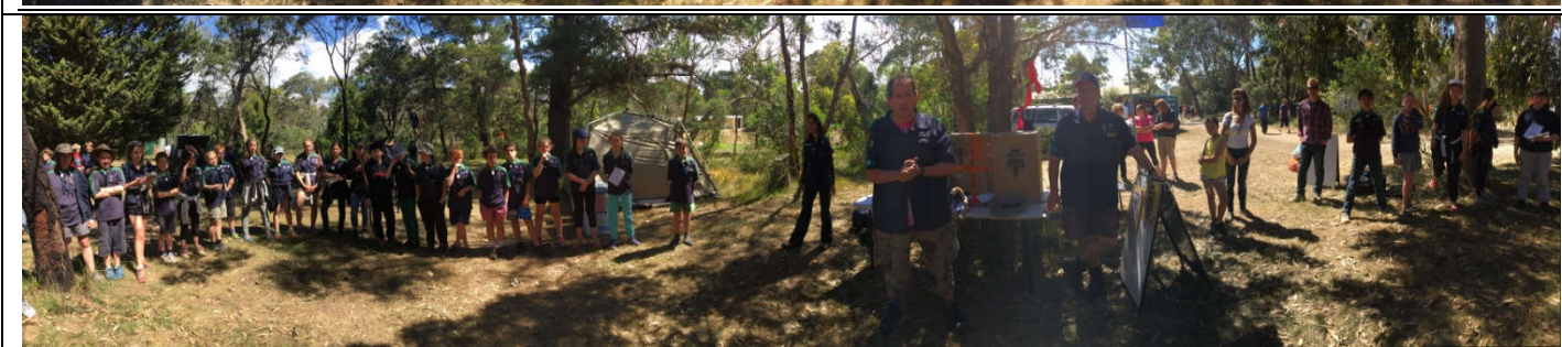
Prize Giving - Everyone who is anyone watches as Scruffie awards Prizes to the winning Patrol and Individuals who have met his very high Standards of Behaviour, Attitude and Competition. Further he used the opportunity to teach the leaders some Public Speaking skills. - Is there anything that dog can't do ?