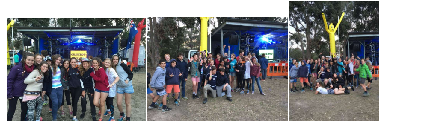
A nice calm photo with the Yellow man..... but then came the masses