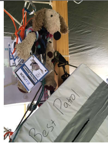
“Scruffie the Adventure Dog (AKA Completion Referee, Philanthropist, Canine Patrol- PATROL LEADER )”

“Local Philanthropist Dog offers Prize for Patrol that completes the most events ”