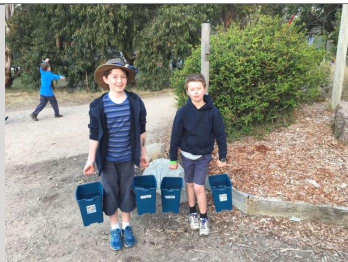
Local Scouts follow Scruffies example to help Leaders run the camp and keep the dogs hydrated.