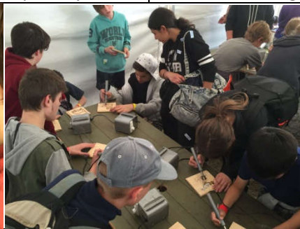
Wood Burning with Soldering Irons. Sharks attempt the perfect likeness of the great leader