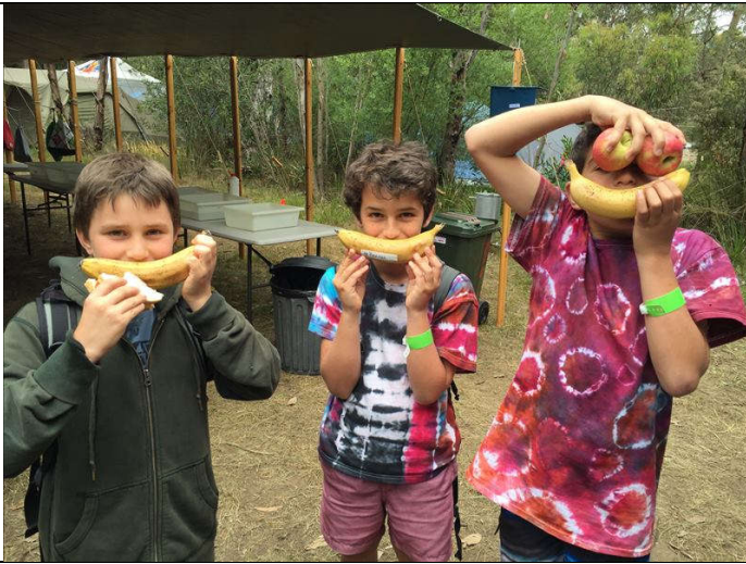
Wheres the FRUIT ! - THERE's the Fruit !