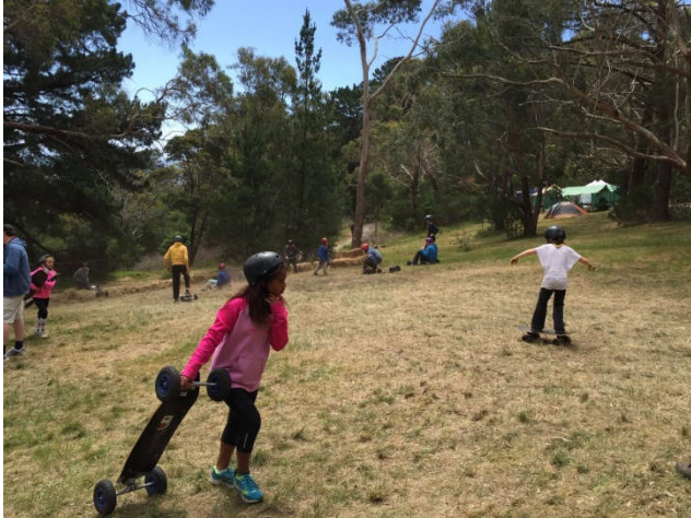
Mountain Boards - Crashing is not compulsory