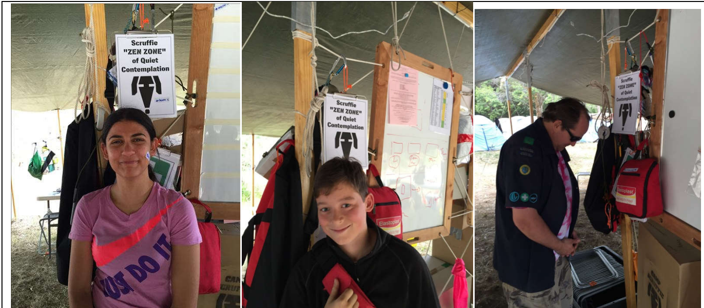
SCRUFFIES "ZEN ZONE" of quiet contemplation. Sometimes Scruff needs you to spend some quiet time with yourself