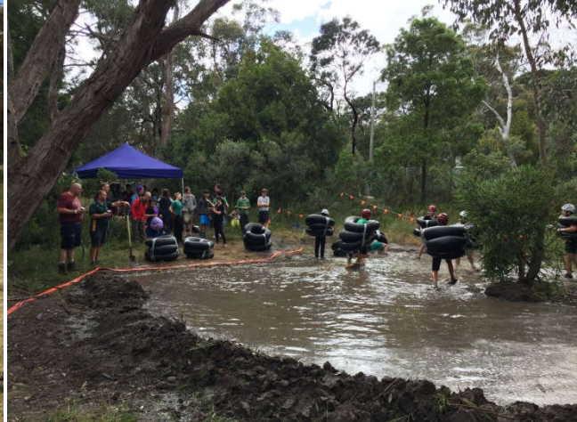
SUMO Wrestling - Muck in and you can MUDDLE through