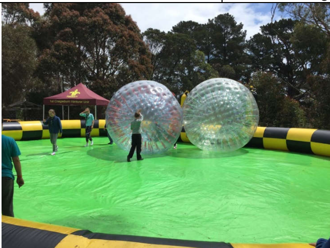
Very very Abzorbing (ZORBING)