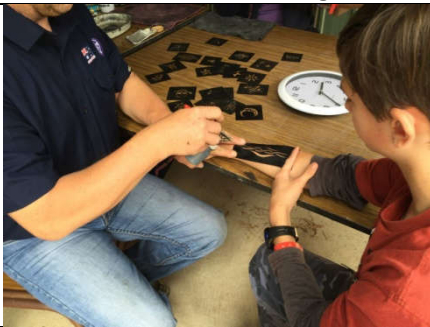
TATOOOOOO een (These are not the droids you are looking for)