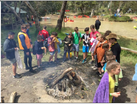
CAMP FIRE - With Safety dog standing by - Very Safety consious - No Joke here.