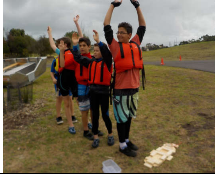
Loading and Unloading a Boat - Best do this on land before you get wet.