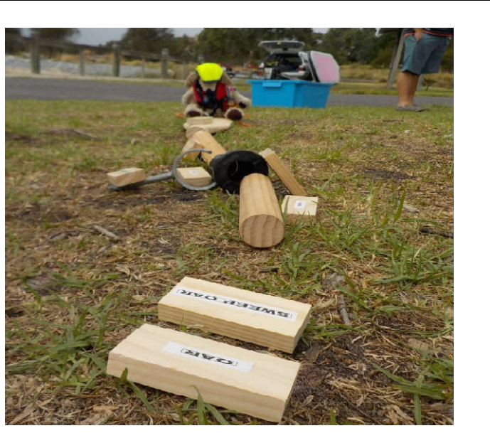
Scruffie says : Why did you cut the Oar up if you just want to put it together (editor: I think its a game for parts of an oar)