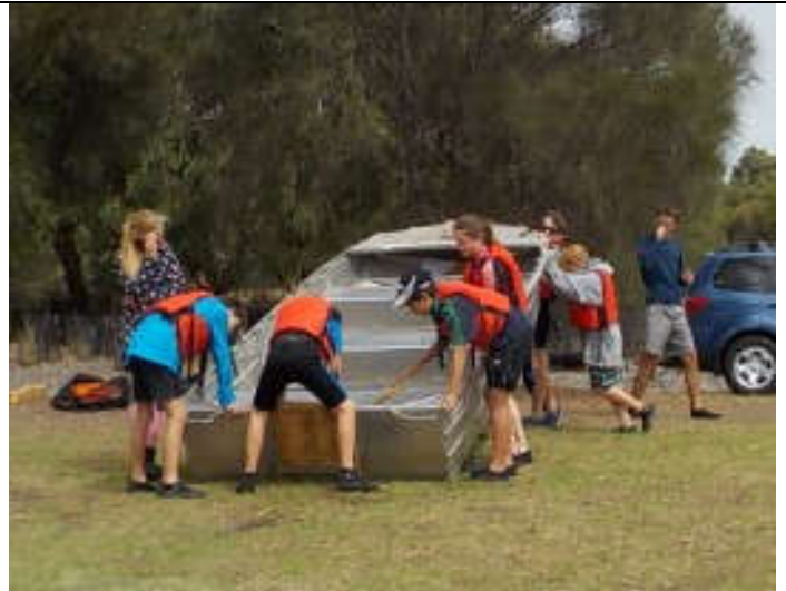
... this is a rowing boat...