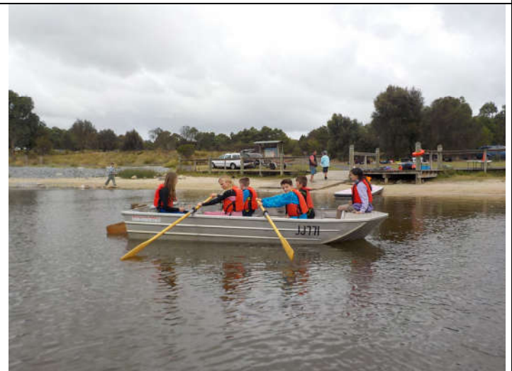
Pull Away together .- Great Team work