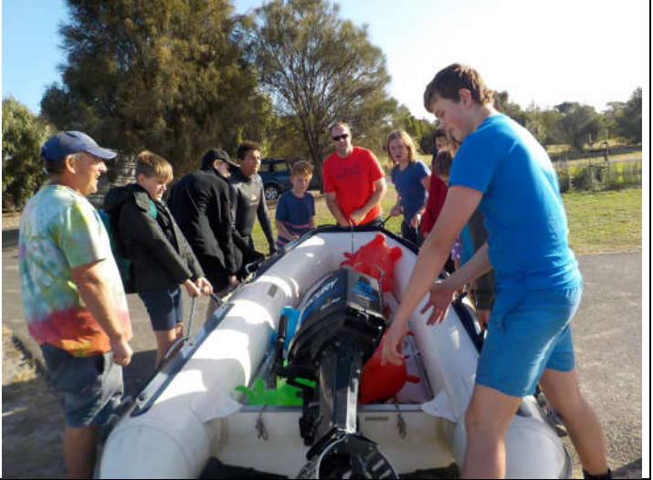
What a Team - Scruffies Team for Day 1 - Looking forward to Double Next week. Scruffs Packing already!