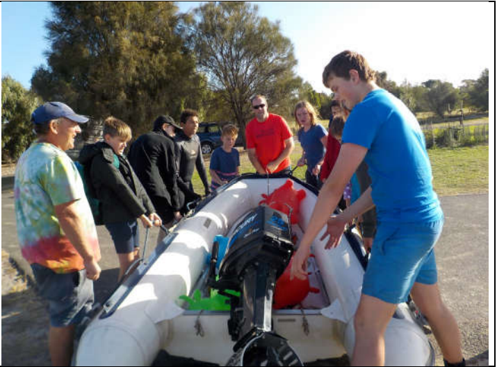
What a Team - Scruffies Team for Day 1 - Looking forward to Double Next week. Scruffs Packing already!