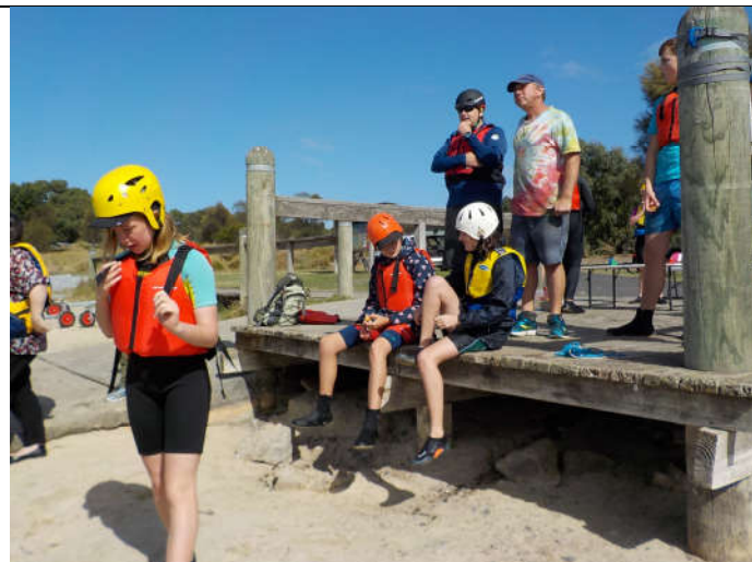
Careful planning as the wind changes and the circumstances change(AGAIN!!)