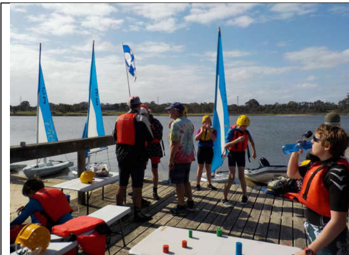
Afternoon tea - And further Planning - Scruffie wants to RACE...