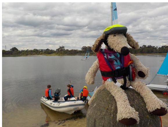
“Scruffie the Adventure Dog – Sailing Expert , Pirate Captain, Relationship Mentor, Mature Student Tutor ”

“Local Sailing Expert Scruffie recruits more keen sailors to join his ‘PAC’ (Pirate Adventure Crew)...”