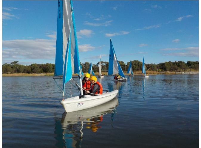
Even the ones who were a bit 'distracted' on the day...Some crews are more aligned than others.