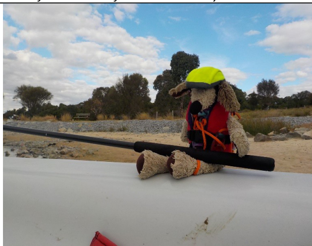
Scruffie decides to take to the waters..There comes a time when you need to "lead from the front"