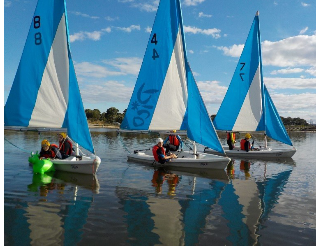
With beautiful glassy waters, things start steady for the sailors. First past the Green Cow wins.