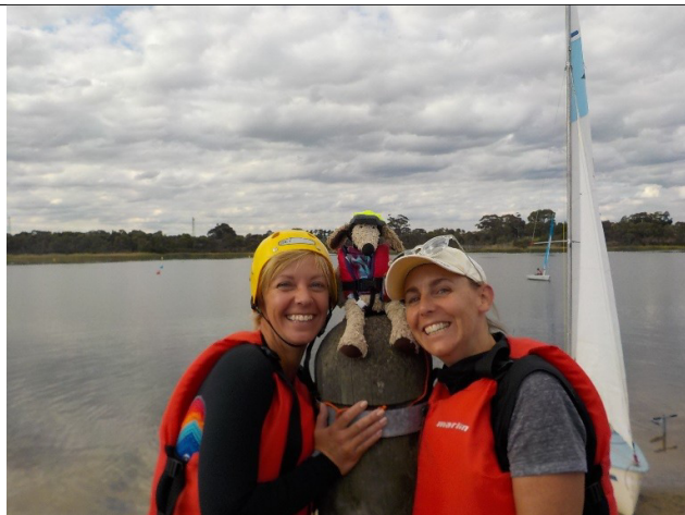
Scruffies new 'mature students' ...Fortunately Scruffie caters for all levels of Skill and maturity.