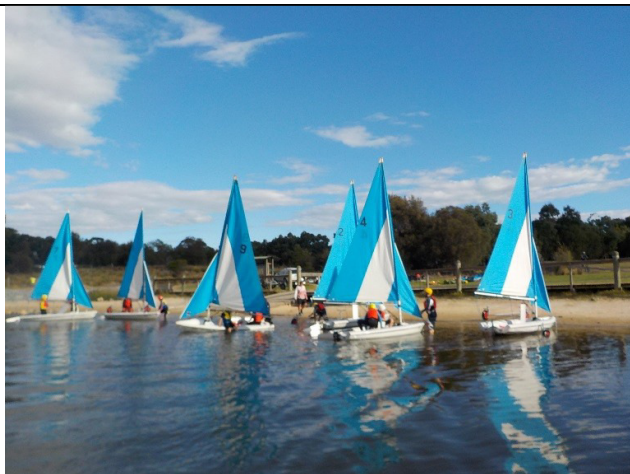
Time for Tea, The Sailors have earned a break, So Scruffie leads them to the Beach so that they can have a 10 min Break, TEN MINUTES. Mind. !