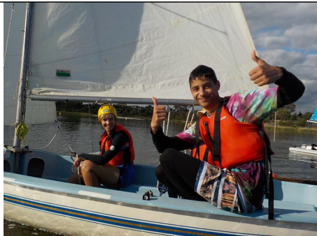
How Good. This GOOD . – Scruffies Students show their appreciation for his masterful teaching.