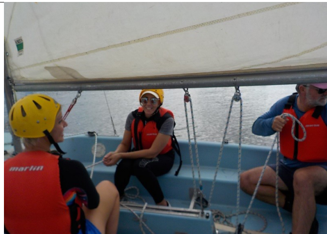
More sailing and less chatting please ...