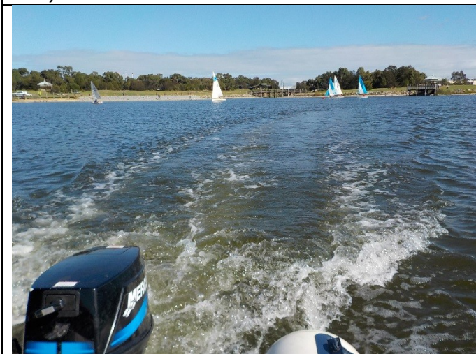
Unfortunately the Safety boat Operators were very bored, Scruffie tried to help by creating some accidents but everyone was too well behaved, So - Bored they remained...