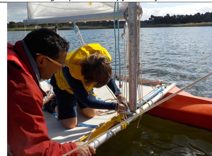
Some dynamic boat fixing. Scruffie was pleased to see some cats. Scruffie likes chasing them.