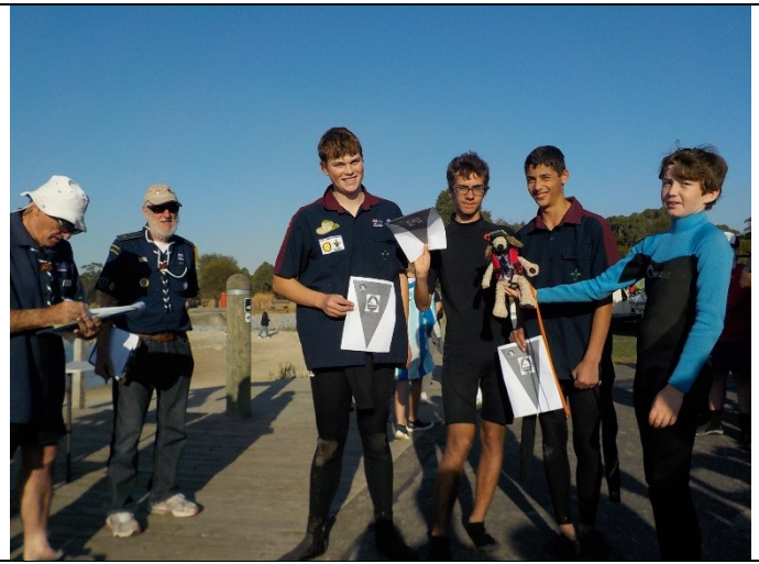
Prizes for the Venturers . Scruffie Awards the Crew with Least injuries per caper.