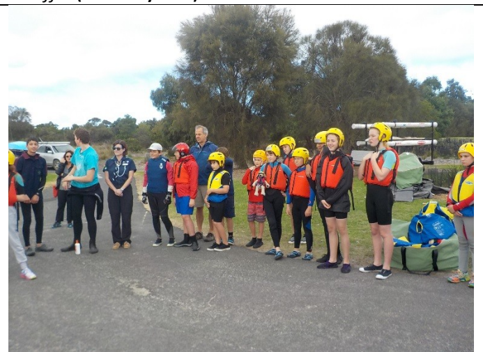
And the teams get ready- Helmets, PFDs and Close toe shoes please, Same rule for Everybody. (And PDF's?ed )