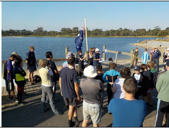
Closing parade. Scruffie is really pleased with the flag poles he sub contracted.