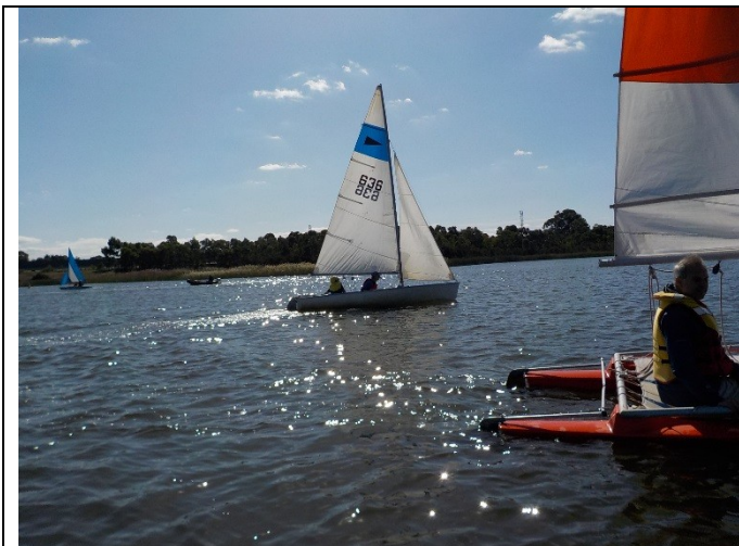
636 was a Boat to watch , and old Sea dog was in Charge, showing everyone the way, then he left for the Footy!!