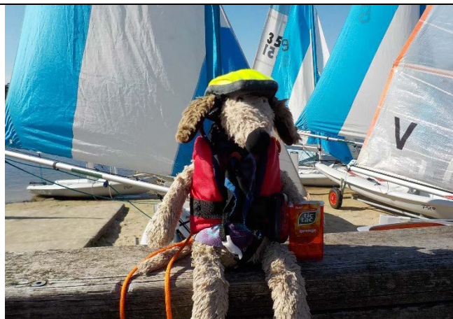
“Scruffie the Adventure Dog – Sailing Pirate, Crew Leader, First mate to all mates , Newly promoted Pirate Captain”

“Pirate Captain Scruffie pressgangs many new members to his crew and a small sailing race ensues”