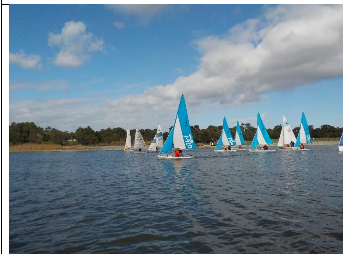
Let the races begin...