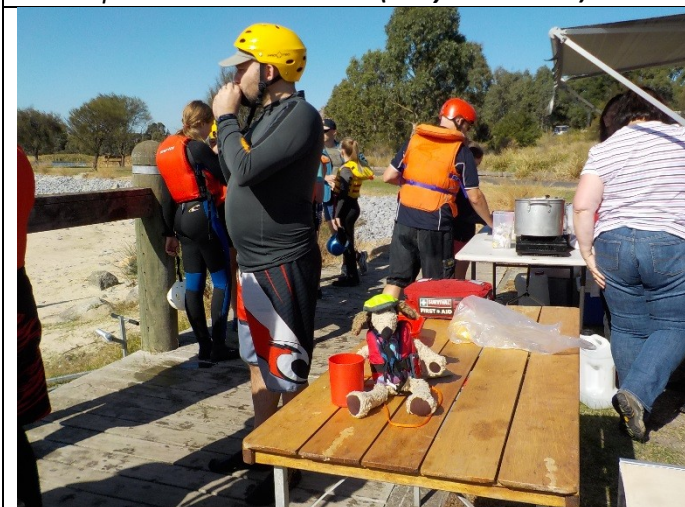
Tea break (Coffee Surely ed!)