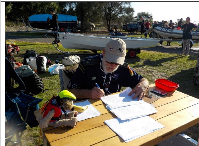
Scruffie keeps a close eye on the scoring..