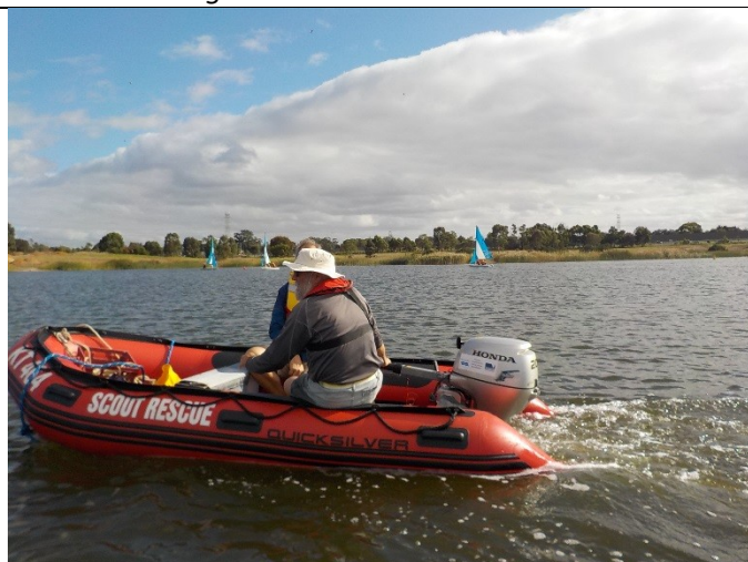
Before hitting the water again searching for the accidents that never happen. But scruffie Know the event cant happen without them, So THANKS SAFETY GUYS!!!