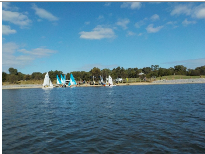
Scrufie Loves karkarook, Water, beach, Wind, A hill. What more could a dog want?