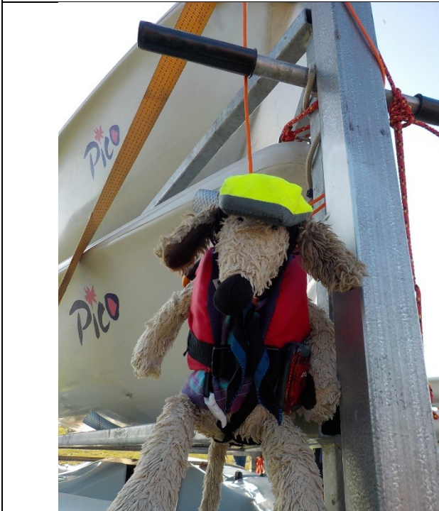
Scruff organises the boats. A safety Check By the Chief Safety dog ensure that the boats and Crew are Safe until the Action Starts.