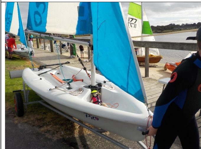
Preparations to get on the water begin. Works is directed by the More Experienced...