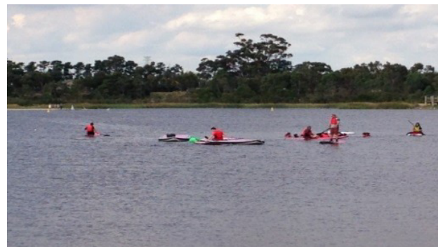
TWO GREAT LEADERSHIP EVENTS DURING TERM 1 – ROWING & WATER SAFETY