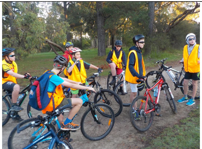
Team 2 - Ready