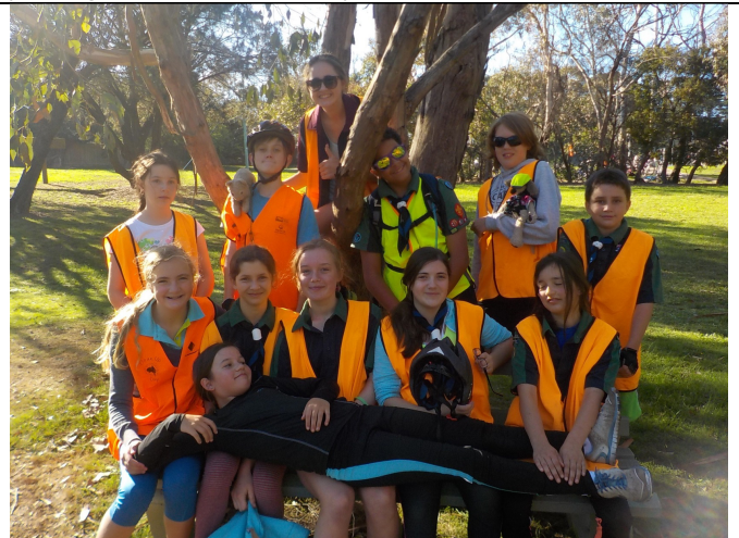
Scruffie has many Friends , here are just a few of them.