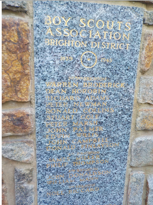
Scouts from Brighton and other bayside groups who gave their lives during the Second World War