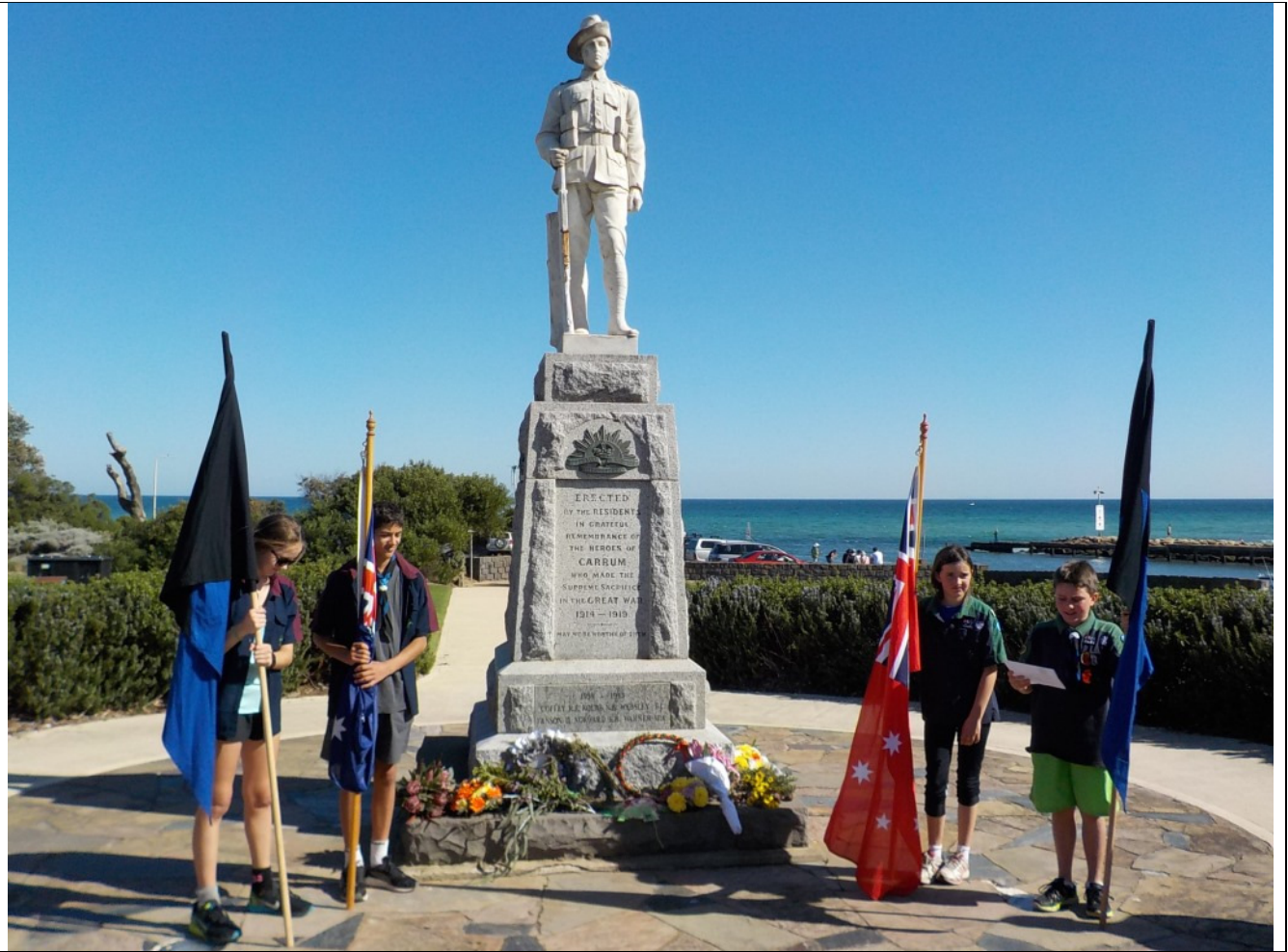
A great Journey , A great Adventure , mateship, appreciation ,valueing our heritage, doing the right thing.