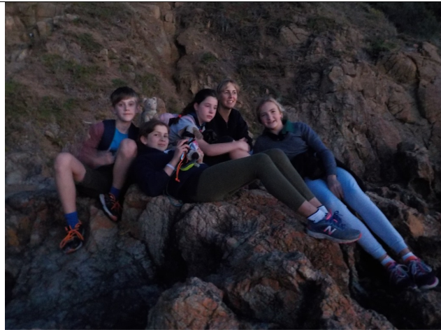
Scruffie teaches many Skills, Cycling , Sailing and ... rock Scrambling