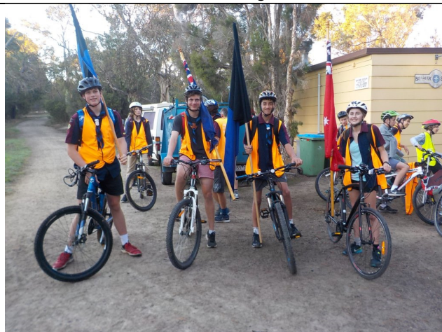
Team 1 – Ready