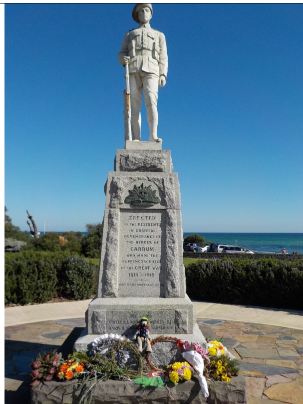
“Scruffie the Adventure Dog – Fast group Cycle leader, Solemn Face of Remembrance, Advocate of ANZAC Vales , True blue Aussie dog”

They shall grow not old, as we that are left grow old: Age shall not weary them, nor the years condemn. At the going down of the sun and in the morning, We will remember them.