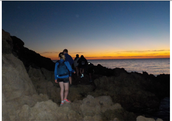
Sunset on the cliffs – More reasons to love Melbourne