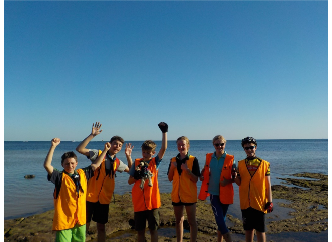
Time for Scruffie to stop at the Beach – and then went fossil hunting – He was looking for a Whale tooth