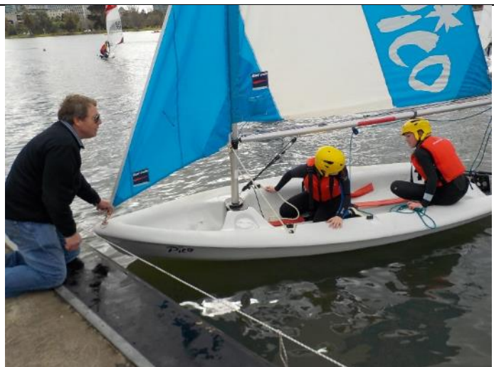
Ready Skipper? Crew ready? Ok lets Go