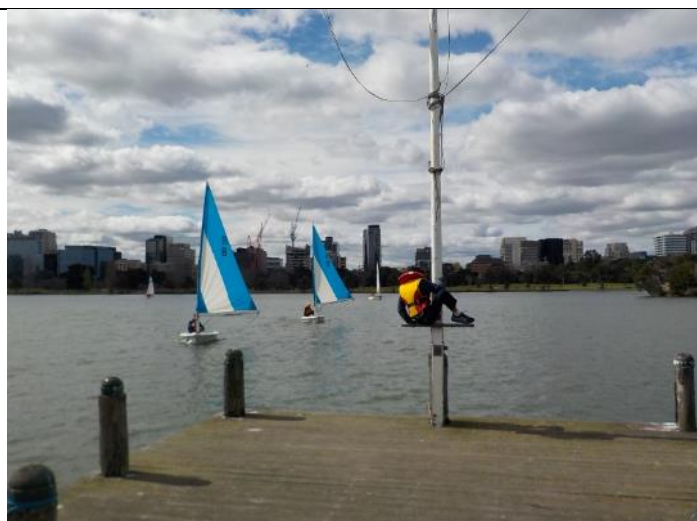
Sometimes you need a focus point on Shore, to keep your tack. Luckily a Naughty Scout provides what is needed.