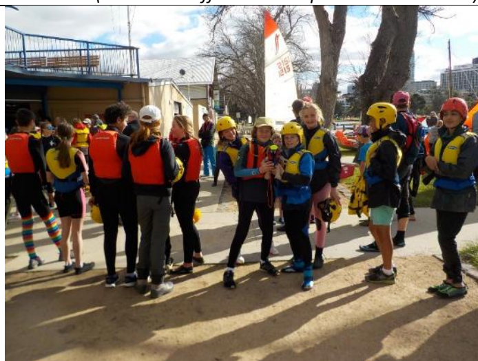
A brief interruption .....Briefing distractions