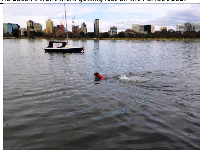
Is it a Bird?.. Is it a Fish? No Its IRON Scout.....