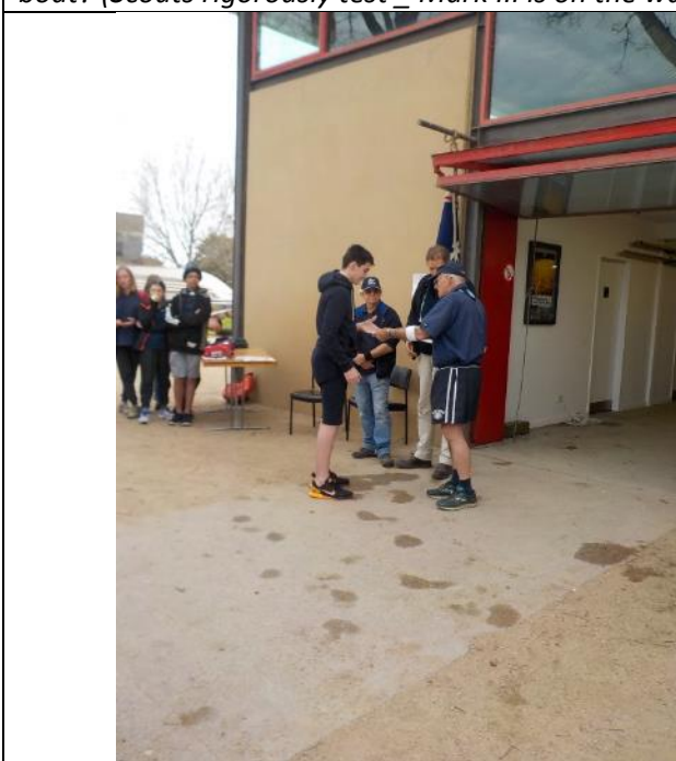
Prize giving - Scruffie agrees with prizes and awards. Especially Best DOG!