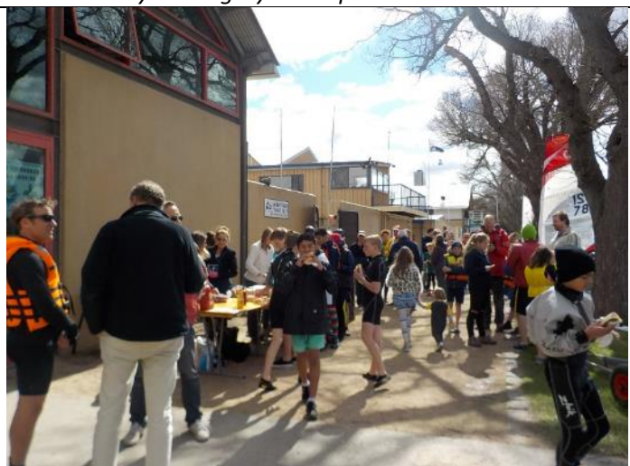
And the burgers and sausages are out...Thanks Parents!