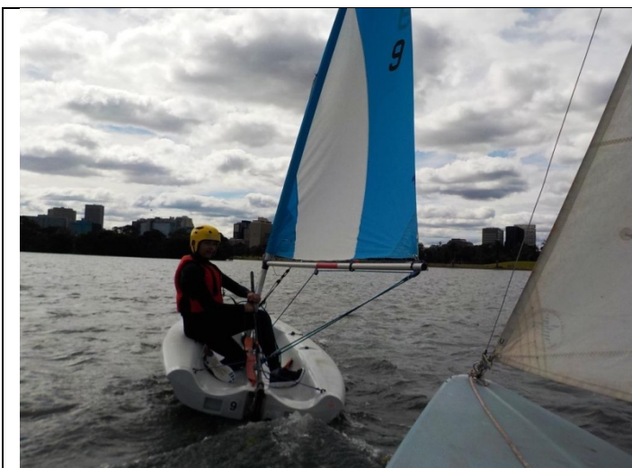
Port Tack - Corsair 636 - the 'Silver Scruffie' is bearing down - Is this some kind of race? Yes. It is