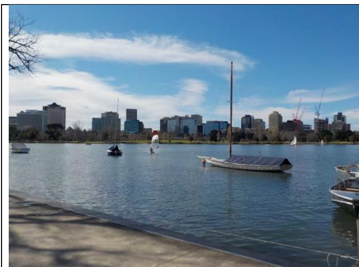
Day 2 begins very calm... and stays calm... I thought the wind was going to be better!