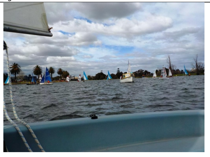
A very Busy Start line - Everyone wants to be on the Starboard tack- Chaos - But Good Chaos