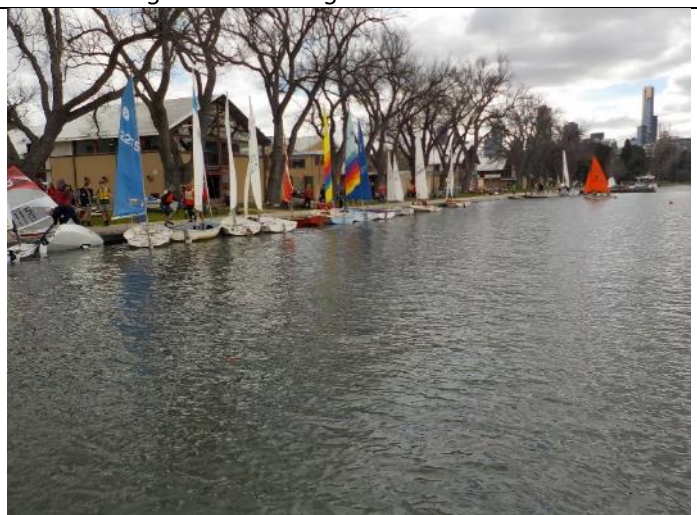
End of Day 1 – what a busy day...41 Sails on the day....