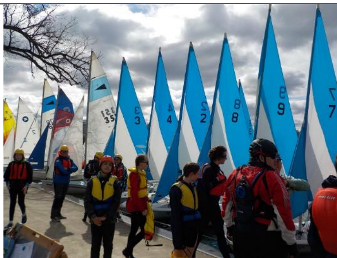
Form an orderly queue to launch - Scruffie Says...Please sign in .....