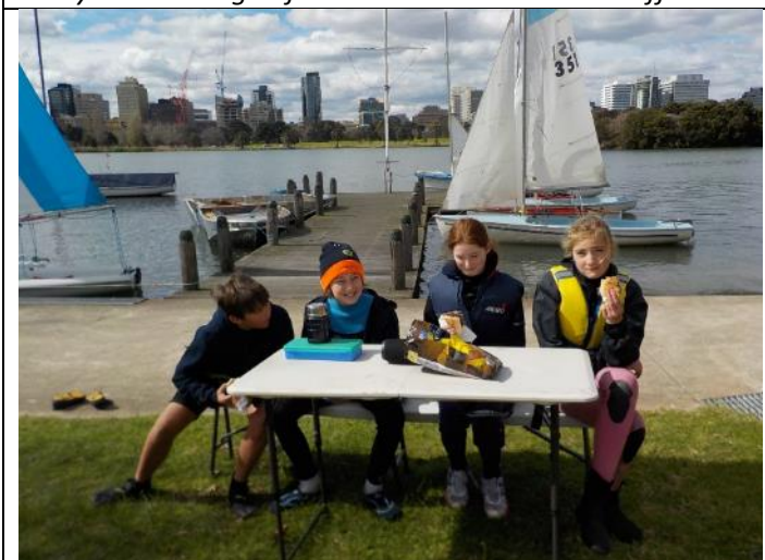
Time for lunch – Scruffie Called a committee to review who had been following the rules.....