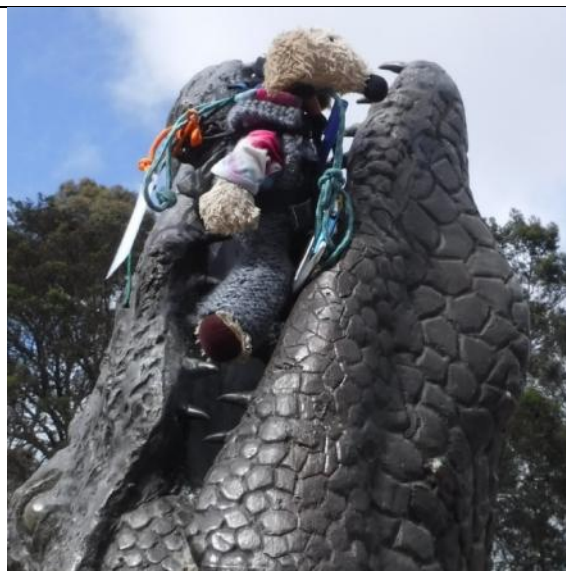
“Scruffie the Crocodile Wrangler, Chief hike Navigator, Chartist Digger leader, WIZZARD