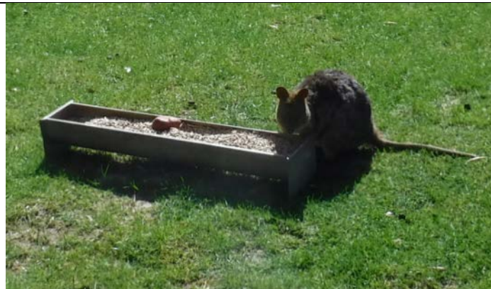
Just Enough time to check in with the Bandicoot - make sure in your haste you do not Crash@!