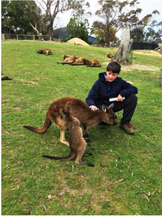
Isn't the little guy Cute ! oh and Look - A Joey - Called Spencer!