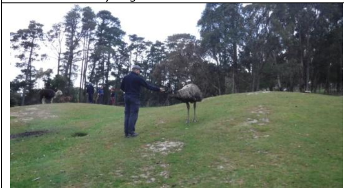
A strange two legged animal approaches .. and an Emu.