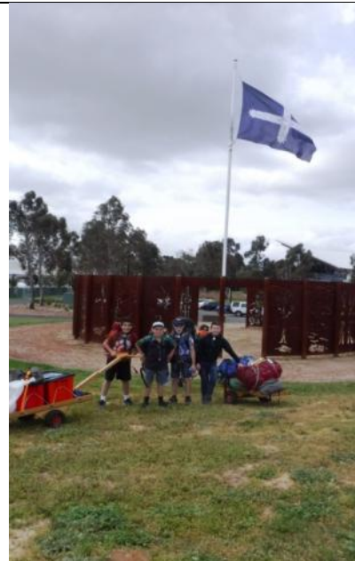
Eureka Stockade - and Southern cross Flag - A symbol of Ausiie heritage to help us consider the origins of Mateship , the Diggers and Chartist Concepts.