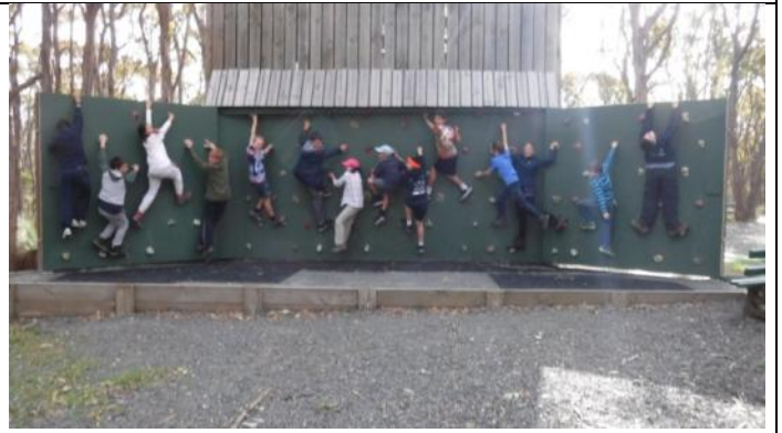
How many Scouts does it take to Hang off a Wall ? (Ed. Is this not a Epic attempt to Storm the castle ?)