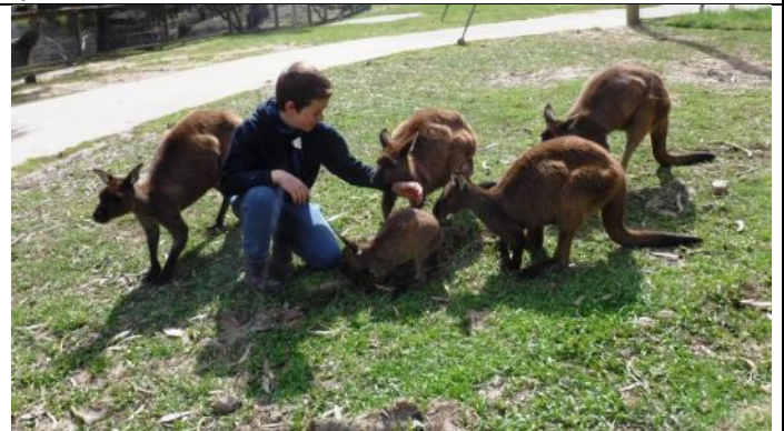
Scruffie Makes friends Easily - A trait he has passed on to others, See how easy it is for A scout to make new friends ( Ed. A pocket full of Snacks helps )