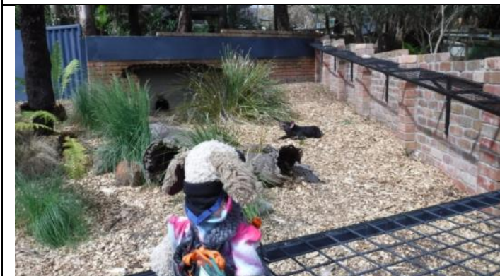
A rare Treat - Scruffie Catches up with Tasmanian part of the Family and Asks about the Ballarat Hotel accommodation - Later he asks after the Uncle Thylacine (who he hasn't seen in years)