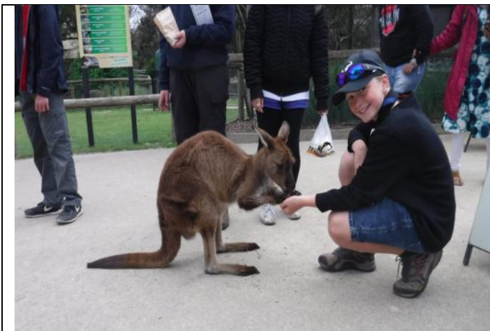
An Aussie Icon - And a Roo. One of these can jump around without injury and the other needs to follow the three Metre rule - Can you guess who is who ?