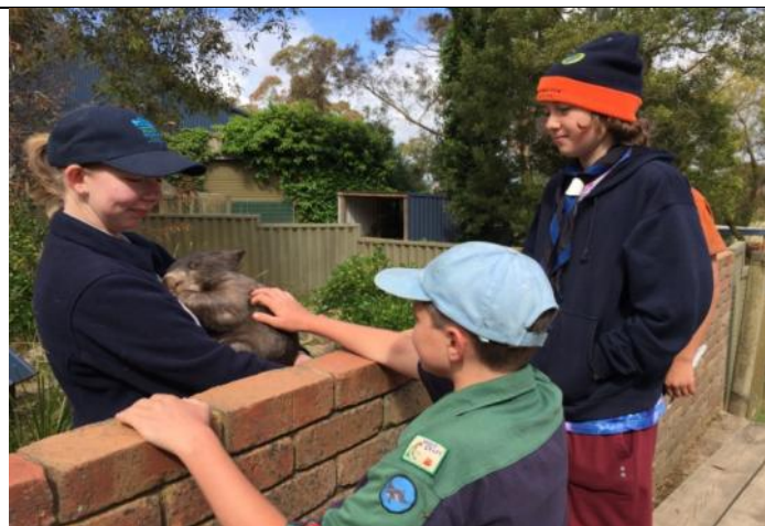
Wow! they start out cute and cuddly .... and then grow up to be ...Well.... Different...Oh and look - A Baby wombat