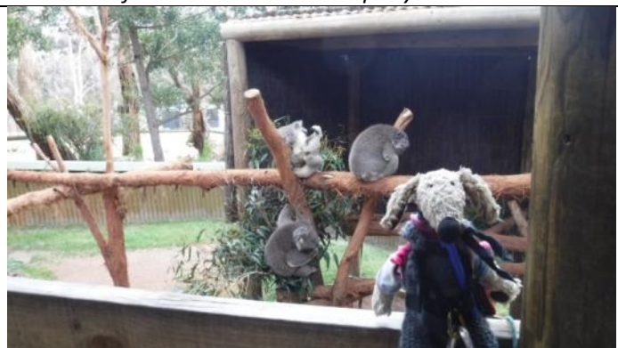
Scruffie Visits some of His Koala friends to deliver messages from the Cousins in Queensland. Its Tiring being this patient and talking so slowly but Scruffie does his Duty.