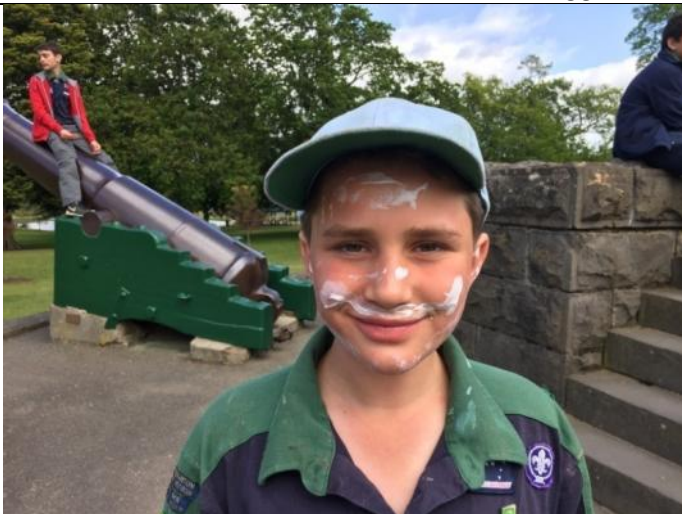
Scruffie Takes Sun Potection very Seriously. One of His Accolites has found a novel way to ensure his New Moustache is protected from the Harsh Aussie sun with a full coverage of Sun cream