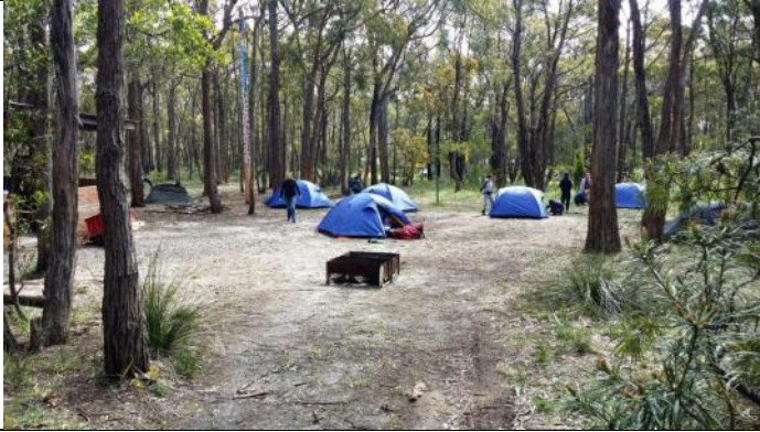
The company Disperses and each patrol establish their evening stronghold, a Fire pit awaits the evening festivities