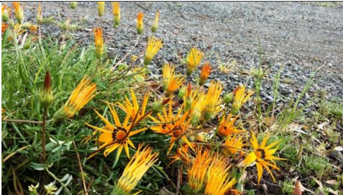
At last a moment to stop and Smell the Flowers