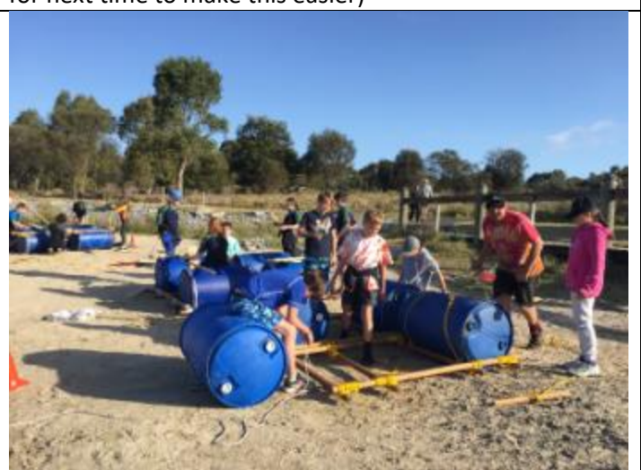
Soon all the Rafts are coming together.