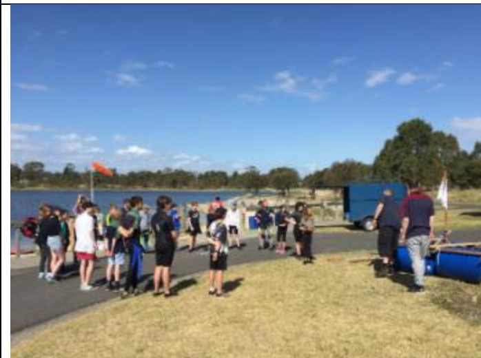
Everyone falls in for the Briefing - Wind is factor today - but Scruffie will deal with that later, for now Scruffie explains the program and materials that will be used.