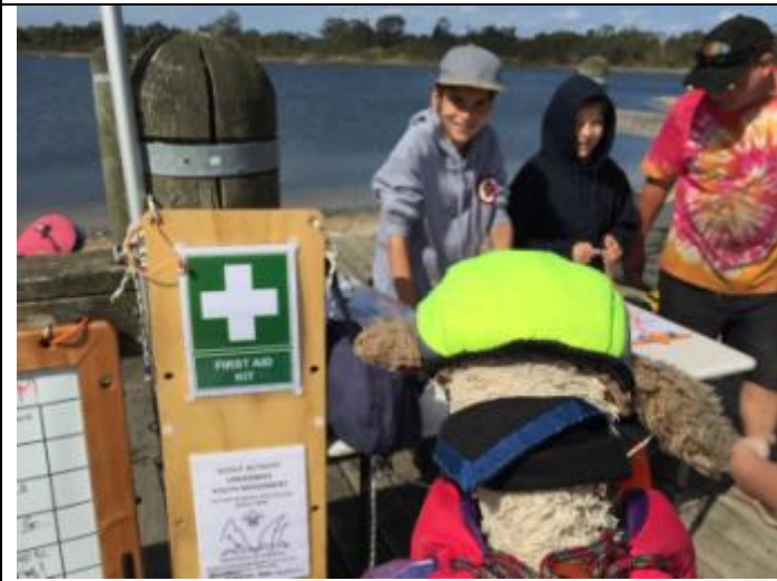
Scruffie Checks that the Environment is Worksafe - He has a Patrol board, Registration , First Aid point, and Briefing and Code of conduct available.