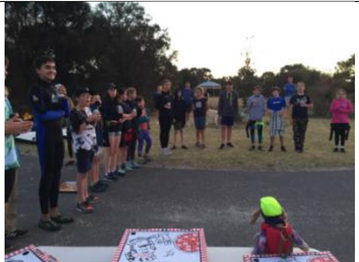
Well done everyone. it Was Fun and prodcutive and effective. The Youth Leaders who attended have a real advantage in the upcoming Leadership day.