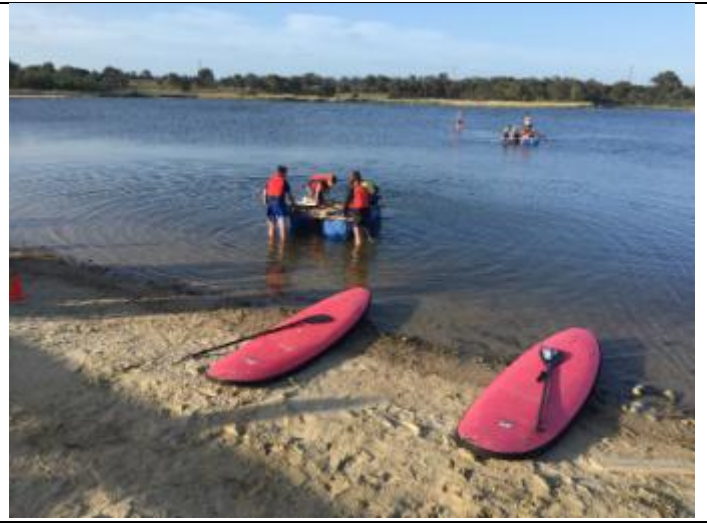
And then they are ready for Launch and of they go....