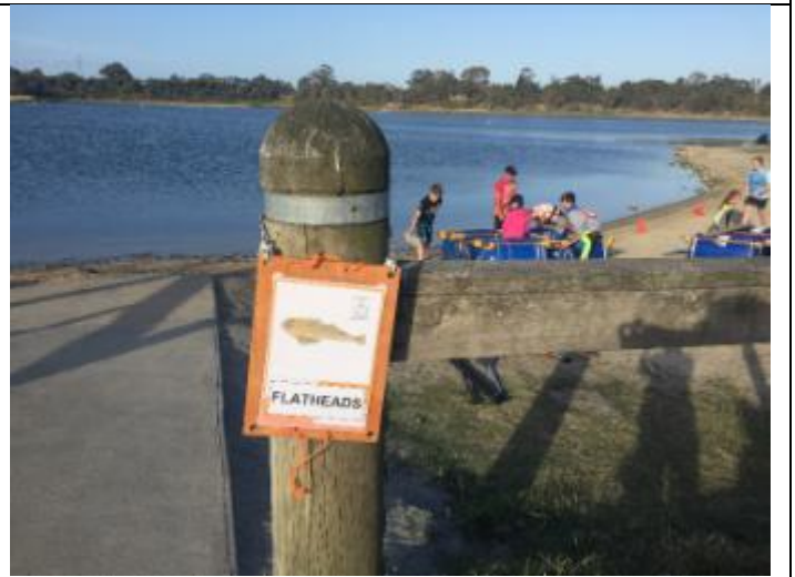
Flatheads ready to launch