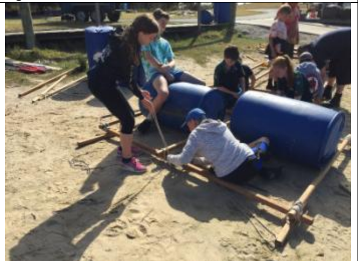
Once the EXTERNAL FRAME is built, then the Crossbeams need to be tide on, As these help hold the BARRELS in, these needs to be Measured, with the BARRELS..