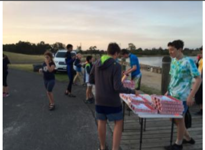
Time for Pizza and Parade