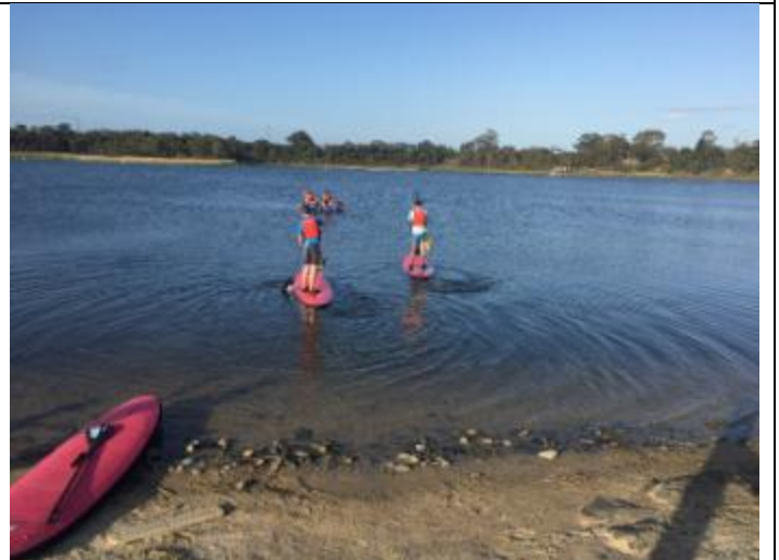
Scruffies Rescue 1 (And Safety) Team head out