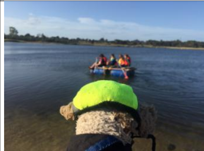
First Team is Away