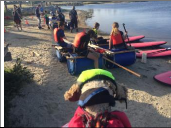
Looks like Frogs are paddling on shore -(Ed. Or checking and planning that everyone knows their role)