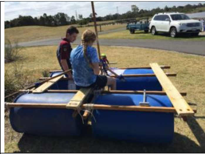
The Youth Helpers come early, Under Scruffies supervision they build a SAMPLE or MODEL RAFT, This so that Scruffies mates can visualise the Outcome.