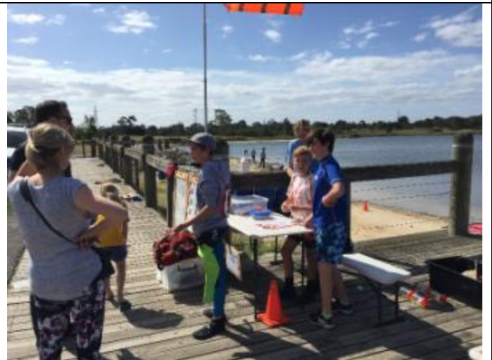
Next the Youth Start arriving, the PROCESS is always the same , Find the REGISTRATION DESK, Sign in , Pay for Dinner . Easy As.