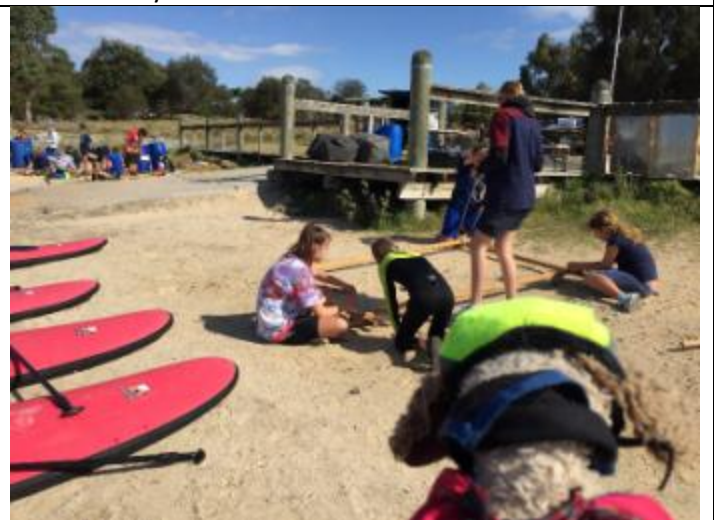
Then its off to the beaches - Each patrol has an Assigned area and an Assigned Leader or Youth helper. - it Doesnt help if you have to MUCH help. Just one person helping at a Time please.