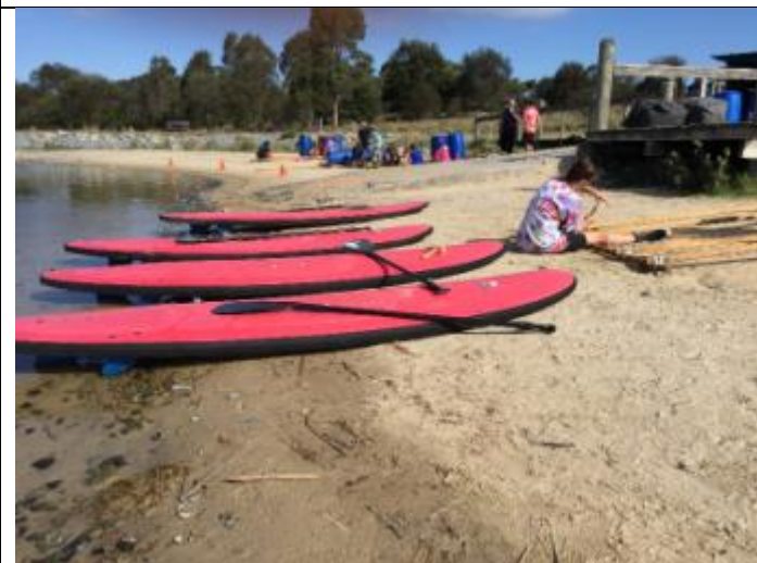
Great Progress is made, Soon the FRAMES ARE FORMING UP - The Resuce boats are ready. Just in case (Ed. Just in case the lashings are loose ? )