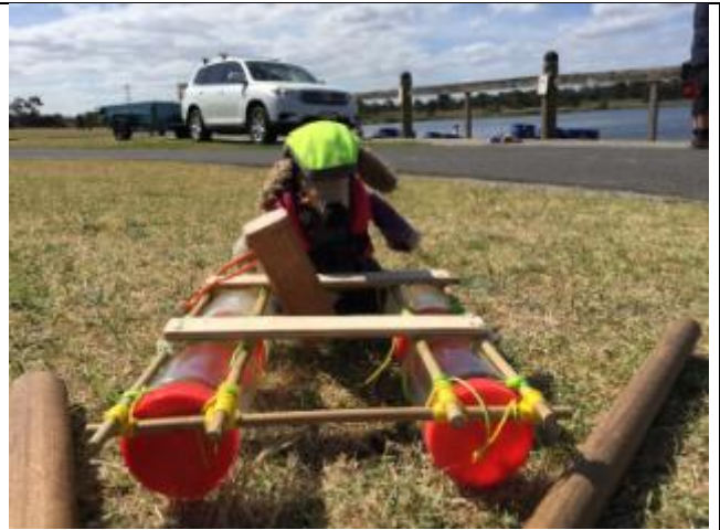
“Scriffie the Adventure dog, Pirate Liaison Officer, Chief Raft Architect Horse lover and Anti Gambling advocate

And annoys people who disagree with him, even though he respects their rights to hold alternative views.