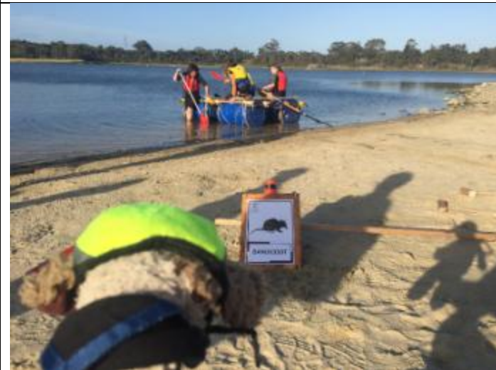
Bandicoots ready to launch