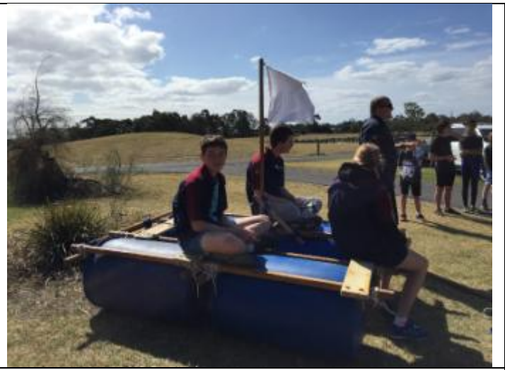
The Youth helpers build a flag pole on their Sample RAFT. Then they sit ready, Sometimes its your job to sit and be an example to others. (Ed, Its a pity its a White flag and not a PIRATE FLAG)