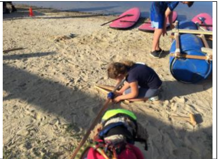
Some patrols have time to build a flagpole. Scruffie has some new ideas for Some Patrol FLAGS