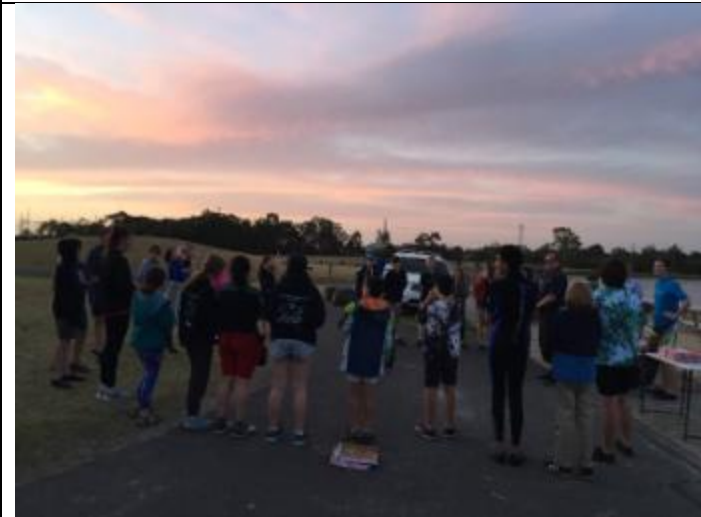
The weather treated us well and a Beutiful Sunset Frames the Parade. There is chance to be thankful and show appreciation.