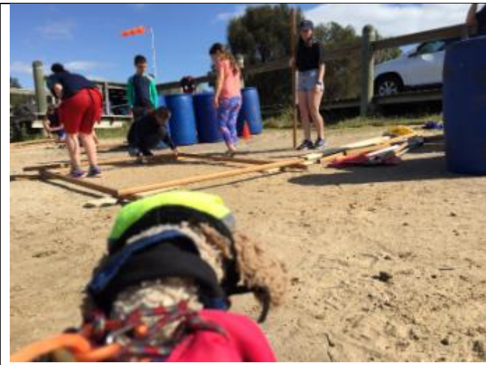
The Starting point is to Lay out the EXTERNAL POLES, this gets the measurements and Sizing correct. Scruffie's mate Tony has measured and cut everything in such a way that it all fits in the trailers yet can still fit together