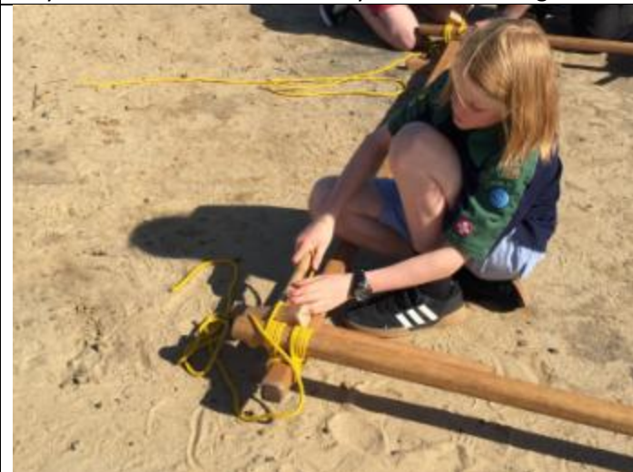
Some others have already mastered it. Its one of Scuffies TOP 10 SCOUT SKILLS that EVERY SCOUT SHOULD KNOW