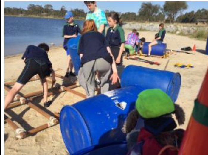
And soon all the BASE LASHINGS are finished, Time to put the Barrels in Place.