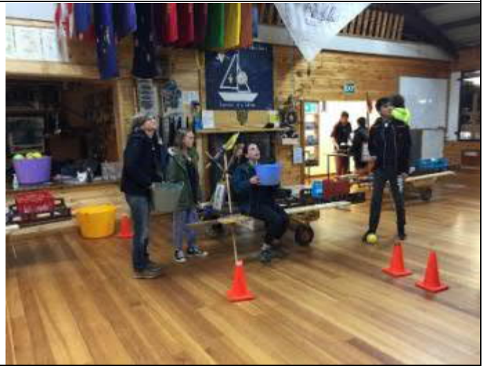
Whilst below the Team Are ready to catch them.....Remember ...Whilst cooking the Snack..Crumpets anyone ?