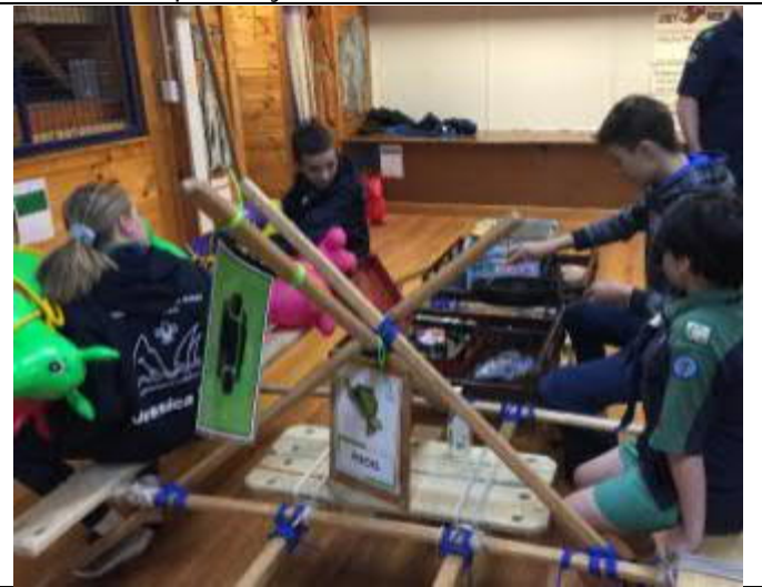
Or RESCUEing the COWS whilst cooking a Mini pancake with Syrup from the Maples...