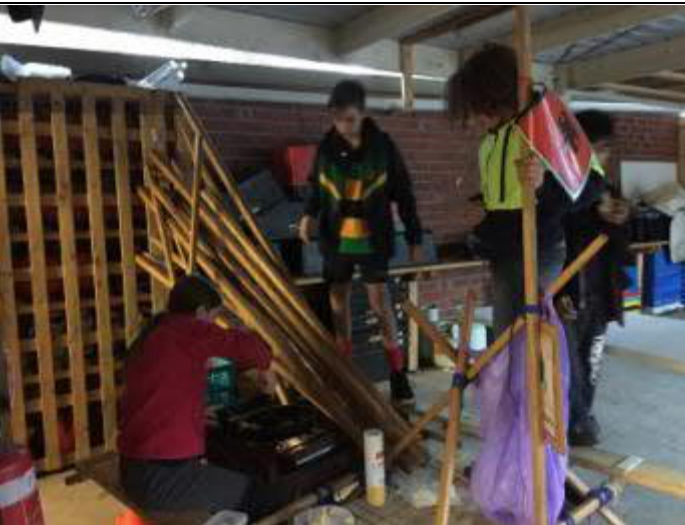
REVERSE PICKUP Sticks.... Balnace all 20 poles... Whilst ..