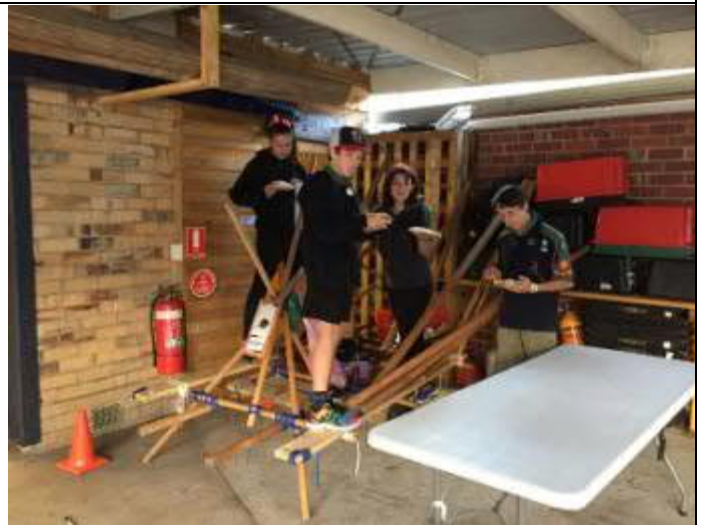
Cooking HASHBROWNS with CHEESE..