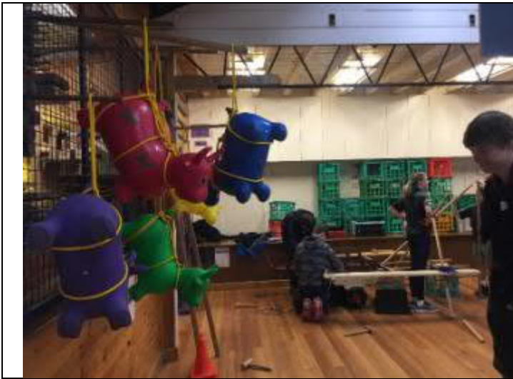
Whilst the YOUTH HELPERS set the challenges up....