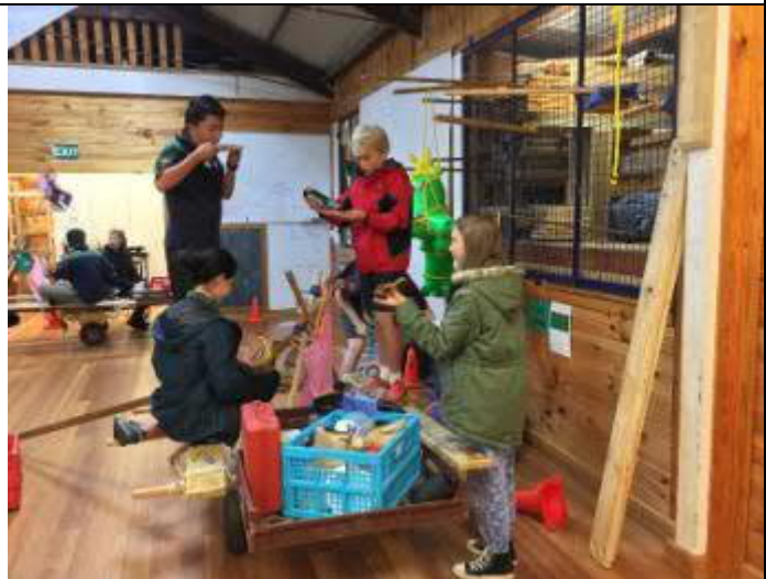
Other patrols do some "inflight repairs" ... More lashing Practice is needed here.