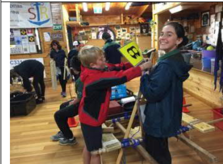
OWLS are very Advanced and They Are ready to get their Flag flying...and their Engine to Take flight.....