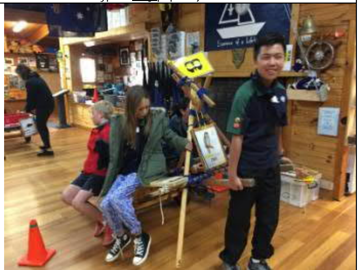
SUCCESSFUL TESTING .....Kitchen and TEAM on Board....Owls about to do another test run...