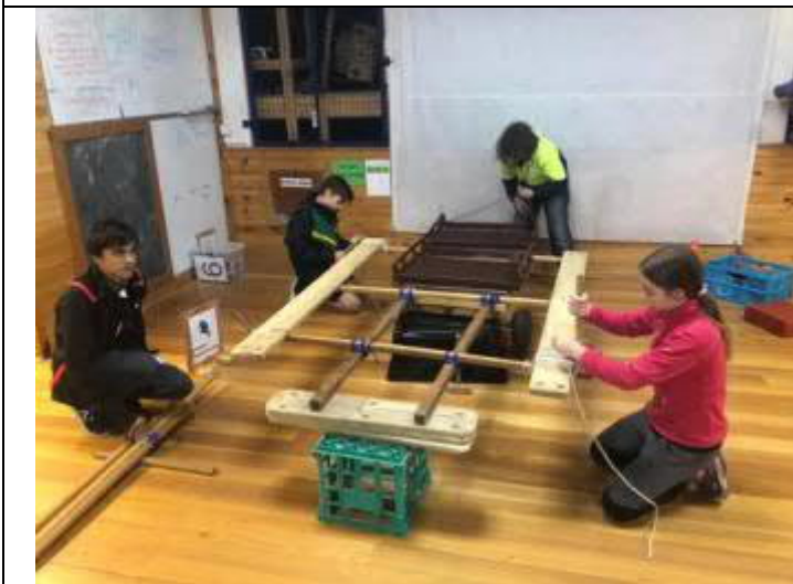
Kingfishers..make progress ....