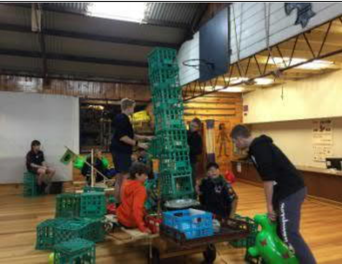
Crate Stacking .... Whilst cooking .....A mini Wrap Pizza.....